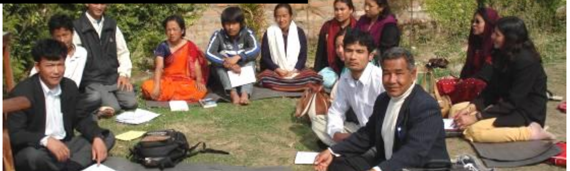
Group meeting is the most essential part of TEE: A group in Katmandu is doing group meeting on the open ground.