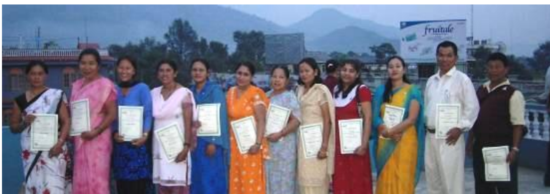
Group of Church Leaders in Pokhara who has completed An Introduction to Biblical Studies . Picture taken at the Graduation ceremony.