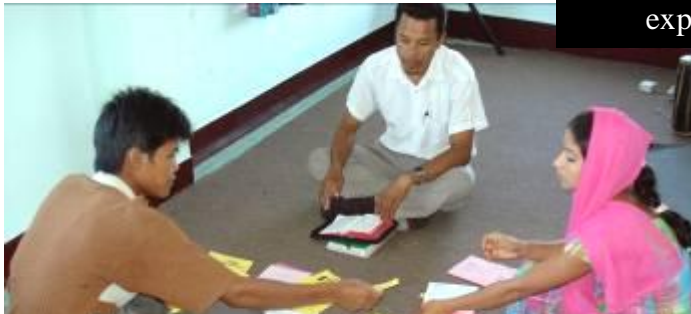
Participants taking part in practical group meeting during three days tutor training in ITEEN office.