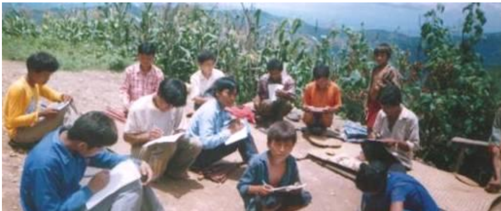
Group of Children from Chepang Community in central region of Nepal. They have done 18 weeks of study group meeting and practical application of the course Abundant Life , and writing exam sitting on ground.