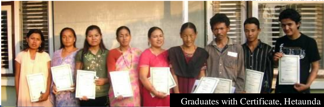
Graduates with Certificate, Hetaunda