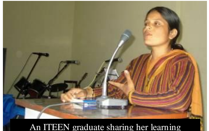
An ITEEN graduate sharing her learning experience in Morang (Eastern Nepal)